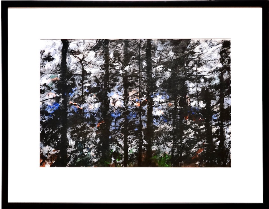
Gordon Smith Untitled (Byway Trees) , n.d. Acrylic on Paper 28 ½" x 36 ½"

604.736.2405 t info@equinoxgallery.com e www.equinoxgallery.com w