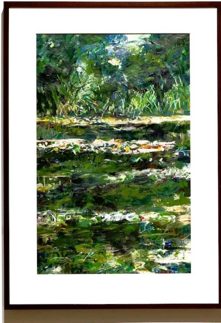
Gordon Smith Untitled (Pond) , c. 1996 Acrylic on Paper 43" x 30 ¾"

604.736.2405 t info@equinoxgallery.com e www.equinoxgallery.com w