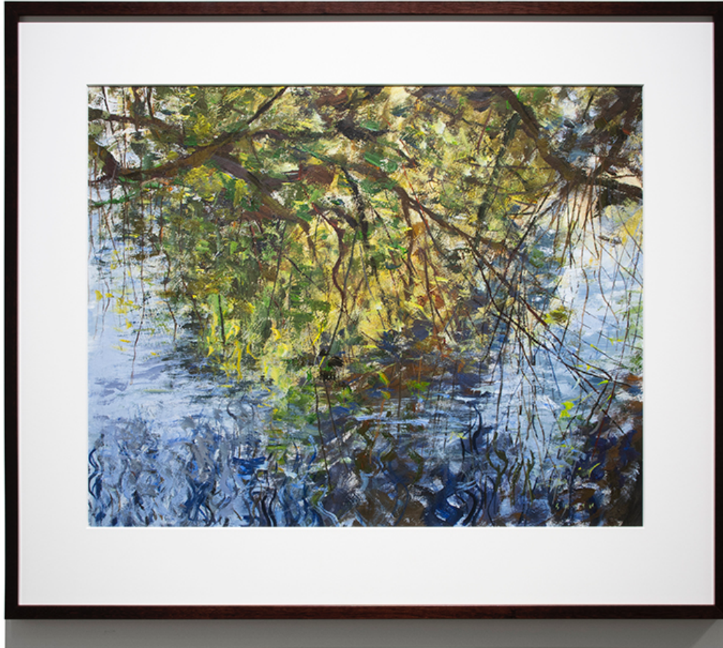
Gordon Smith Reflections I , 2002 Acrylic on Paper 33 ¾" x 39 ½"

604.736.2405 t info@equinoxgallery.com e www.equinoxgallery.com w