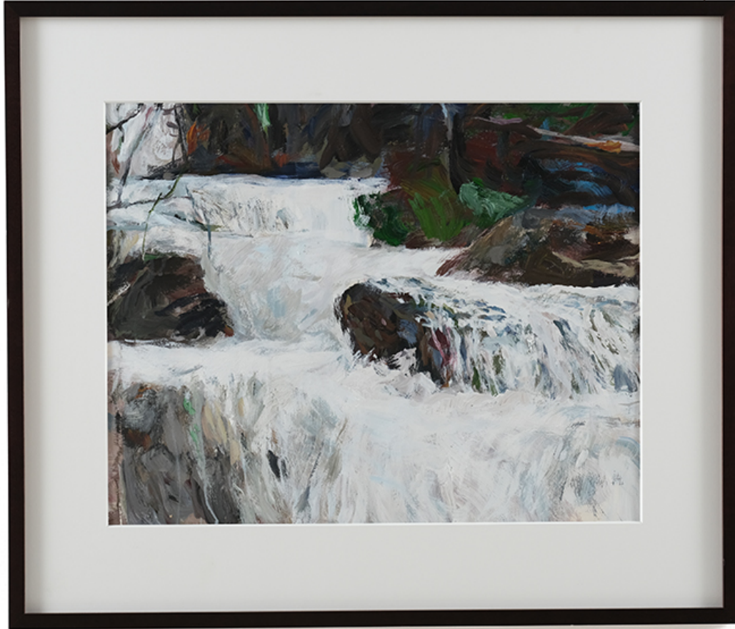
Gordon Smith Houlgate Creek IX Shannon Falls , c. 1990 Acrylic on Paper 28 ½" x 36 ½"

604.736.2405 t info@equinoxgallery.com e www.equinoxgallery.com w